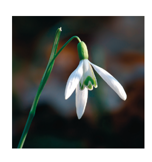
Left: The "Bloom Clock project is a distributed research project to develop a record of what plants are blooming at any given time in a particular location around the world.

There is already some research underway on Wikiversity – including a "bloom clock" of distributed data on what flowers are currently blooming (and where) around the world, as well as research on how Wikiversity itself is being developed and how it can improve.